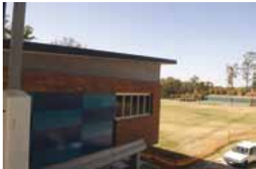
Junior School Students enjoy their new building

In 2008, donations to the Building Fund raised over $28,000, which have been directed to the completion of building projects around the school, such as four new classrooms in the Junior School, upgrades to Boys and Girls Boarding and a new Boys Health Centre.